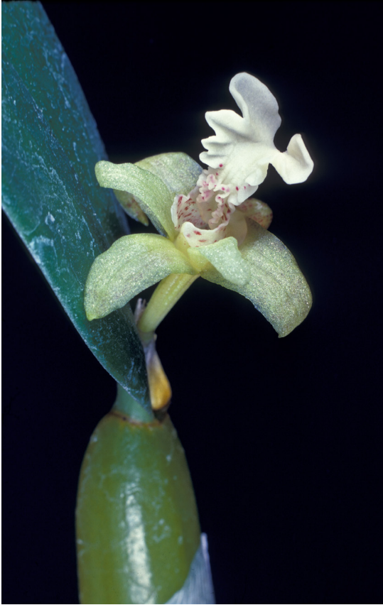
FIGURE 2. Dendrobium krabiense P.O'Byrne ex H.A.Pedersen & Suddee. Flower of Seidenfaden & Smitinand GT 6461 . Photograph by Gösta Kjellsson; previously published in Dansk Botanisk Arkiv 34(1): 96 (1980).

ECOLOGY: Dendrobium krabiense occurs in tropical evergreen rainforest from near sea level to ca. 1000 m in elevation. Here, it grows as an epiphyte on trees and as a lithophyte on limestone rocks.